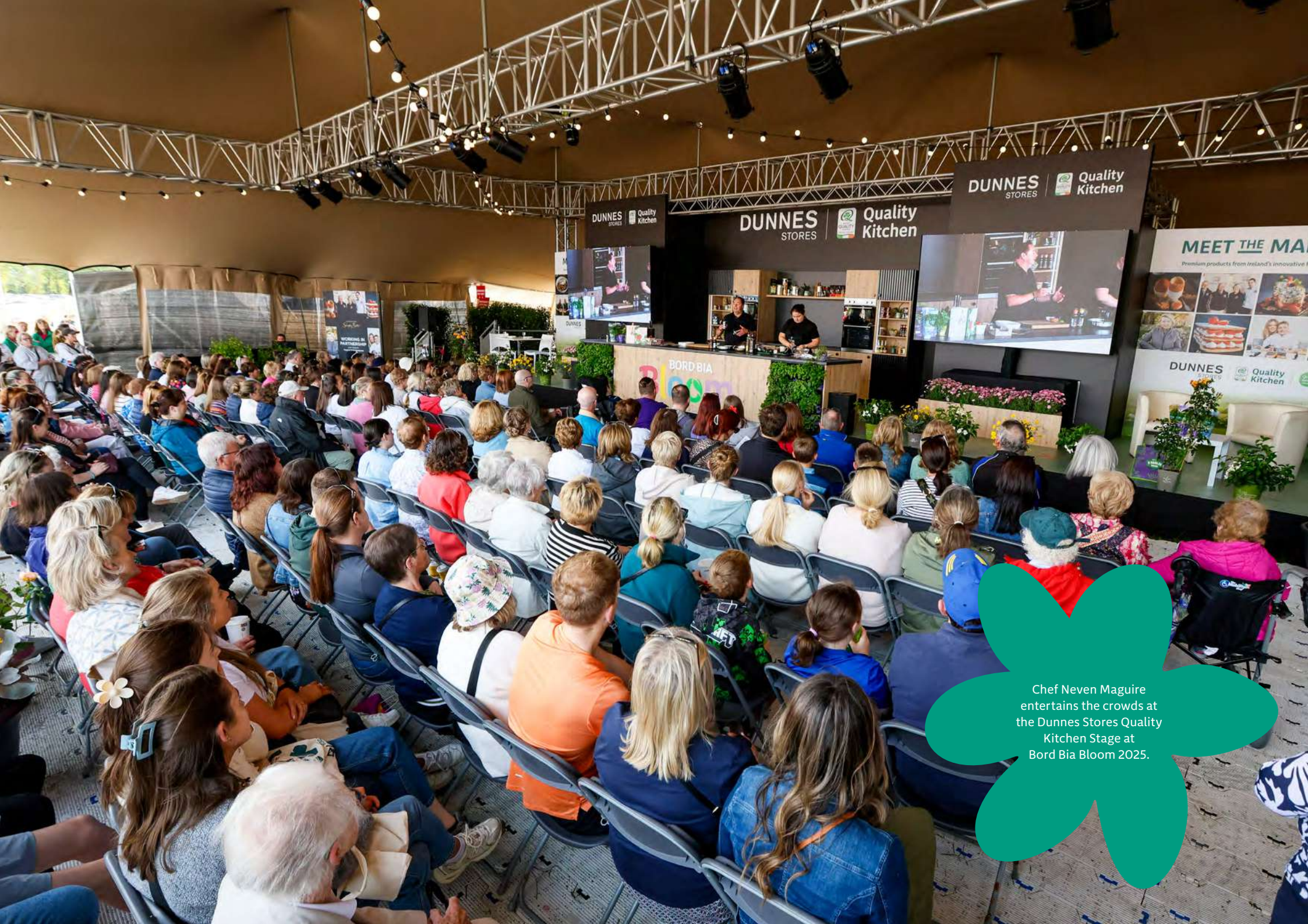
Chef Neven Maguire entertains the crowds at the Dunnes Stores Quality Kitchen Stage at Bord Bia Bloom 2025.